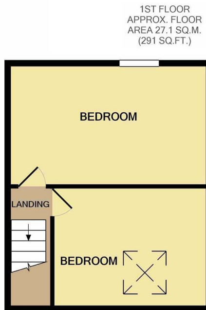
1ST FLOOR APPROX. FLOOR AREA 27.1 SQ.M. (291 SQ.FT.)

TOTAL APPROX. FLOOR AREA 66.2 SQ.M. (713 SQ.FT.) Measurements are approximate. Not to scale. Illustrative purposes only Made with Metropix ©2020